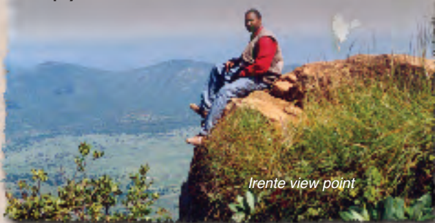
Irente view point

A famous View point where by you over view the village of Mazinde almost 1,000 meters below the vast Maasai plains beyond. On the way back visit Irente Farm a cheese factory where you can enjoy a delicious food of the whole meal.