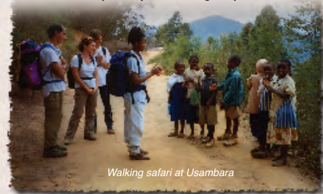
Walking safari at Usambara

A fantastic which combined walk several attractions such as forests a home of black and white Columbus monkeys, traditional villages, view points, visit to a pottery women group,